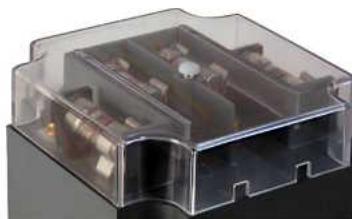
Clear Plastic Cover