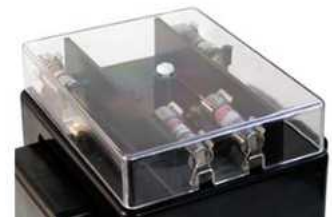
Clear Plastic Cover