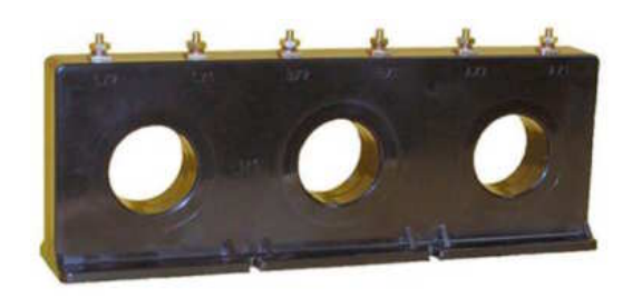
(For Horizontal Mounting)