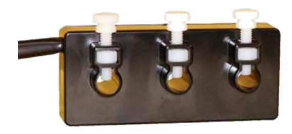
For Horizontal Mounting