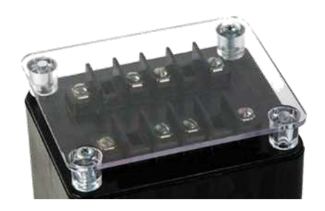
Clear Plastic Cover

Manufactured to meet the requirements of ANSI/IEEE C57.13. Classified by U.L. in accordance with IEC 44-1