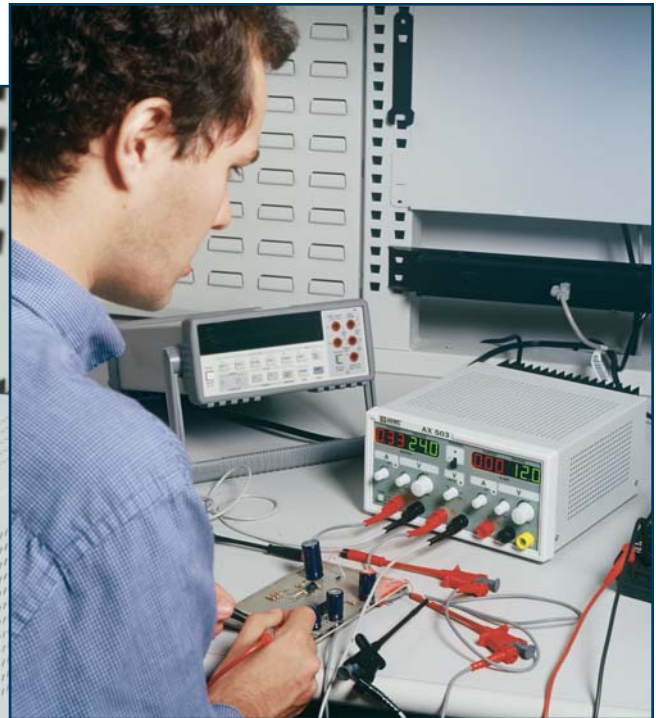
Circuit board design testing using the 30V and 5Vdc outputs