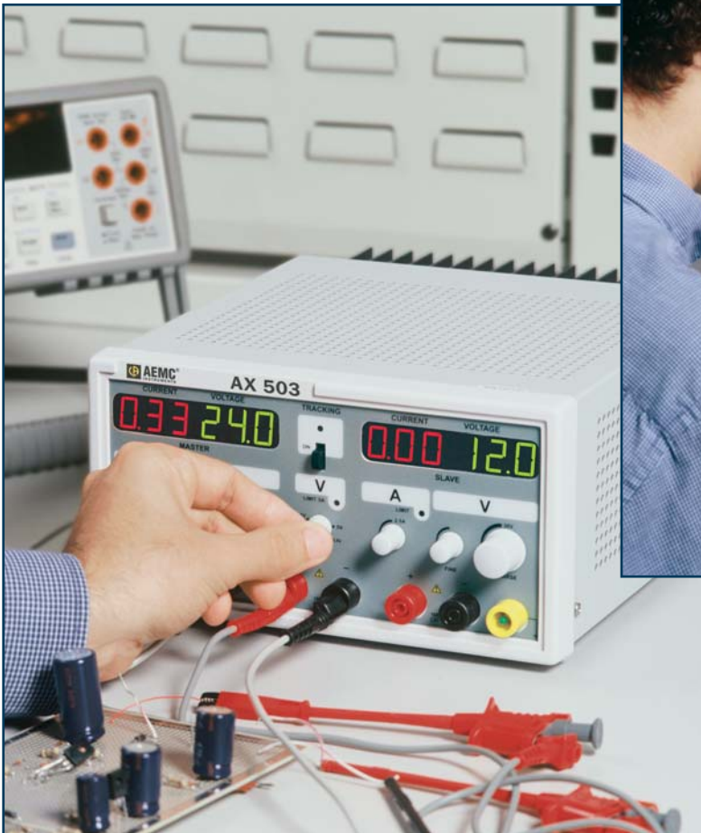
Voltage levels and current limits are easily adjustable from the front panel.