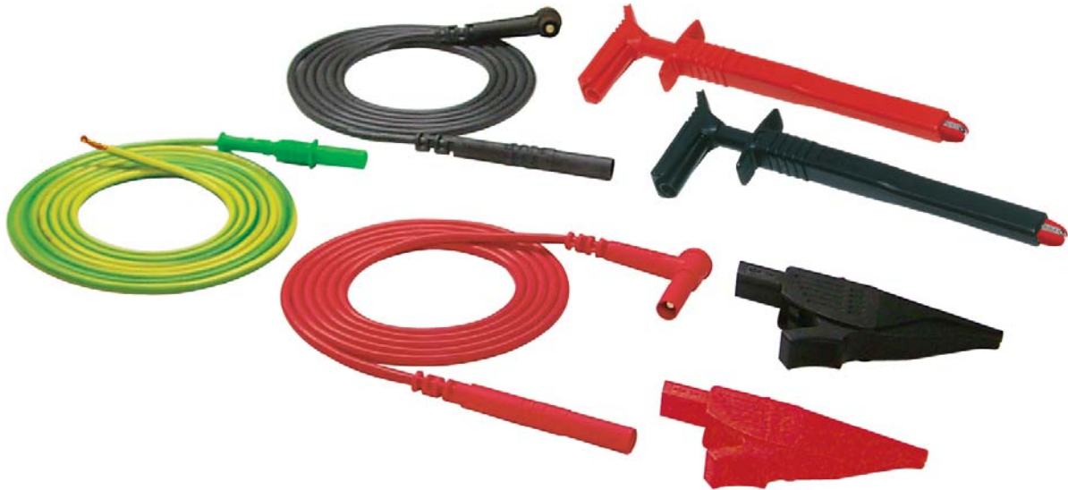
Optional Lead Set includes: two color-coded leads, one ground lead (stripped), two alligator clips, and two grip probes Catalog #2117.78