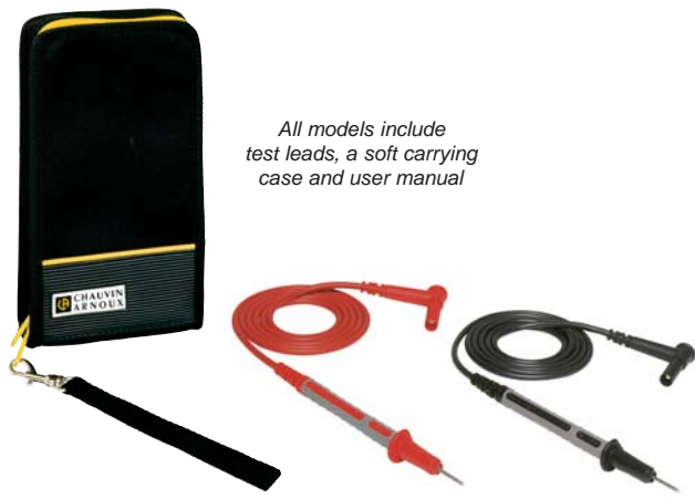
All models include test leads, a soft carrying case and user manual