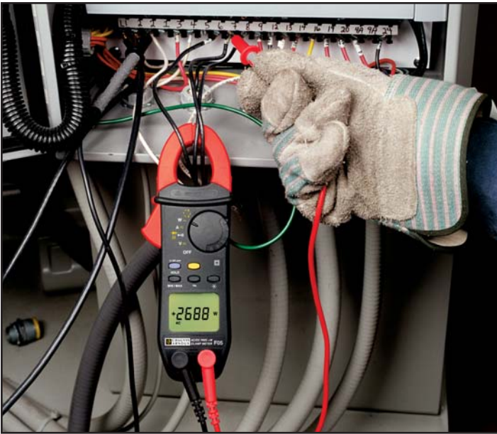
Model F05 monitoring volts, amps and watts on a control panel.