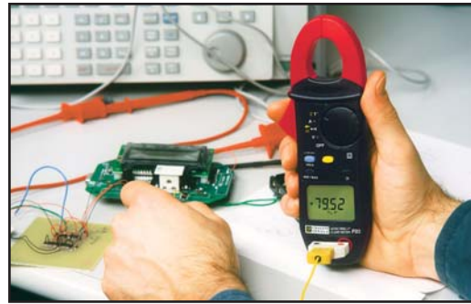
Model F03 measuring temperature on electronic circuit board using a K thermocouple.